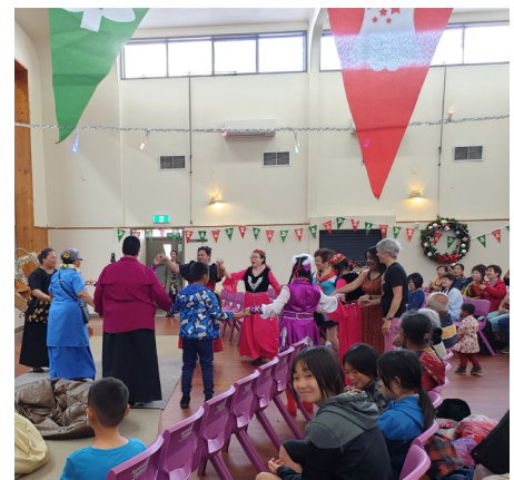
Volunteers from different cultures danced together to celebrate the festival

After the huge success of Boaz's introductory event, there is plenty more in the pipeline. Neighbours Day – Meet your Neighbours on 4th April, outside the Panmure Community Hall will be here before we know it.