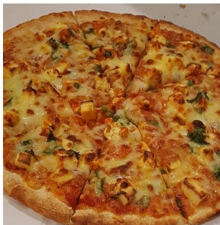
Butter Paneer Pizza