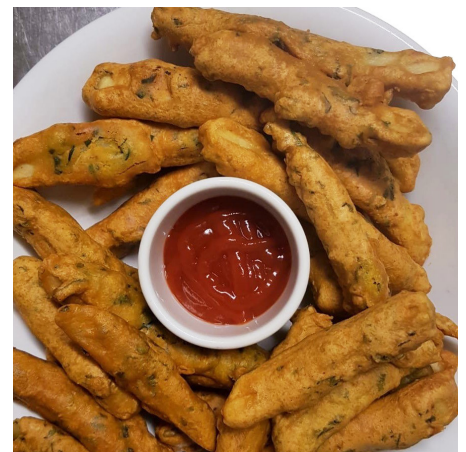
Pakora fries served with tomato sauce