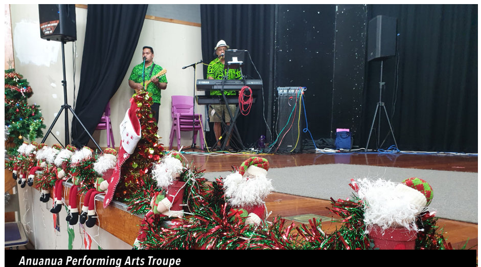
Anuanua Performing Arts Troupe