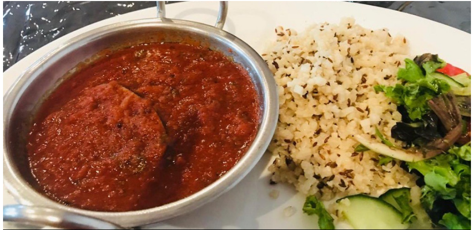
Vegan fish curry with cauliflower rice & salad

On Monday 13th April, they've food for Life Panmure Easter festival - FREE lunch for the community, you've invited!